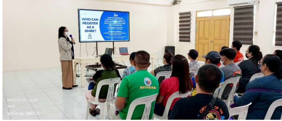
The Department of Trade and Industry Rizal, through Negosyo Center Angono was invited by the Angono LGU Local Cooperative Development Office for the orientation of various programs and services to Angono Micro, Small, Medium Enterprises (MSMEs) and cooperatives last January 27, 2023 at the 2nd Floor Formation Center, Diocesan Shrine and Parish of St. Clement, Angono, Rizal.