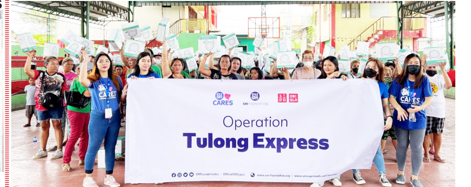
Uniqlo Philippines, together with SM Cares and SM City Rosario, donated melawares dinners set for the families in Barangray Muzon 1, Rosario Cavite who were affected by typhoon Paeng. This is a nationwide simultaneous distribution for the project Uniqlo SM Donation for Typhoon Paeng.