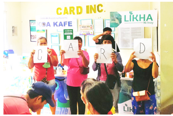
CARD Bank, Inc. and CARD Inc. clients participated in an activity during Koa Kafe. CARD MRI Publishing House brings its pop-up event called Koa Kafe in Sta. Elena, Camarines Norte to spark meaningful conversations over a cup of coffee on August 26, 2022.

The pop-up event was held to bring books and other publications closer to the community. The book, "History of San Pablo: Reviewed, Rewritten, and Retold," was the featured book during the event.