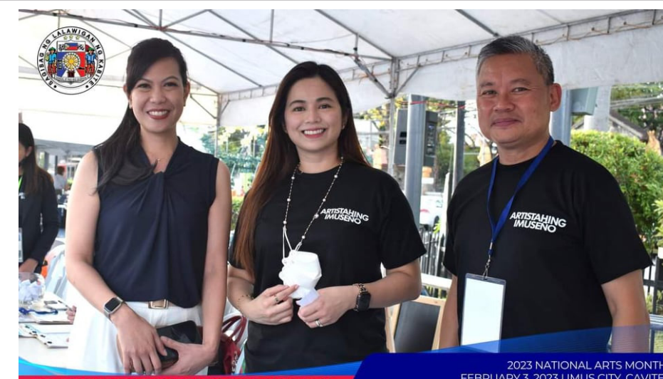
TAPAT SA BAYAN. TAPAT SA USAPAN. 2023 NATIONAL ARTS MONTH FEBRUARY 3, 2023 | IMUS CITY, CAVITE

President Marcos Jr. also gave his support and encouraged the Bureau to remain steadfast in fulfilling the BOC Strategy Map 2023 to position itself among the top 3 Customs Administrations in the ASEAN region by 2025.