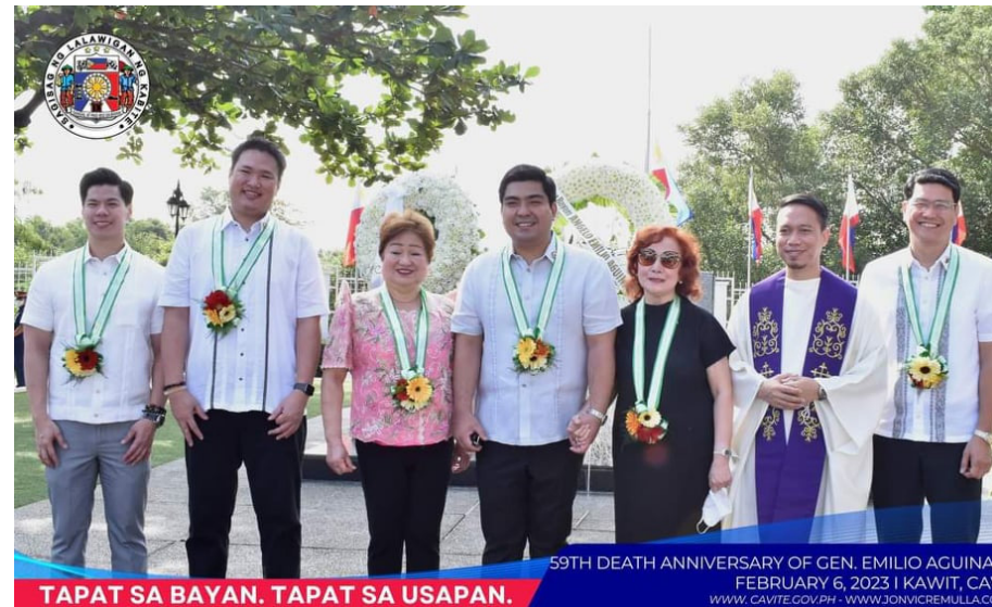
59th death anniversary of Gen. Emilio Aguinaldo. General Emilio Aguinaldo's 59th death anniversary was commemorated through a holy mass and wreath laying ceremony at his tomb on February 6, 2023 at the Aguinaldo Shrine, Kawit, Cavite.