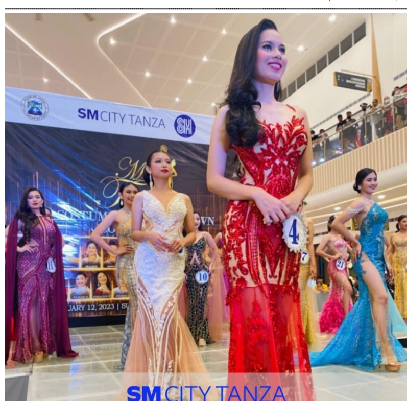
Candidates from Mutya ng Tanza walked the runway with glam and elegance at SM City Tanza during its pre-pageant, showcasing the works of local designers. Mutya ng Tanza is annually held in connection with the celebration of Tanza Day. Since SM City Tanza is now open, it is the perfect venue for such an event. Catch them on the coronation night on February 24 at the mall event center