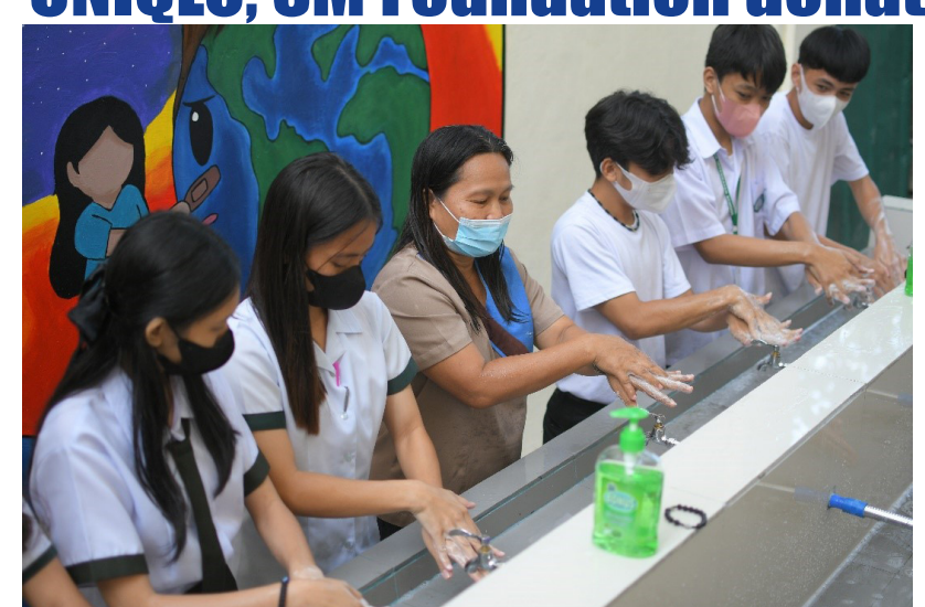
Students of Calamba Integrated School (CIS) wash their hands at the new hand washing station from SM Foundation and UNIQLO.