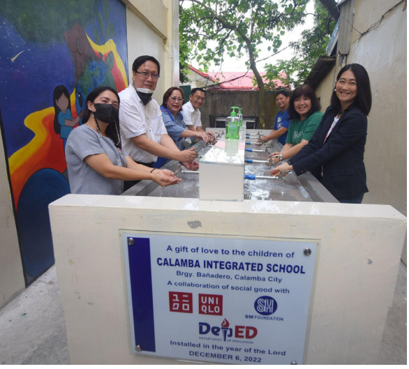
Representatives from SM group and UNIQLO use the newly installed facility.