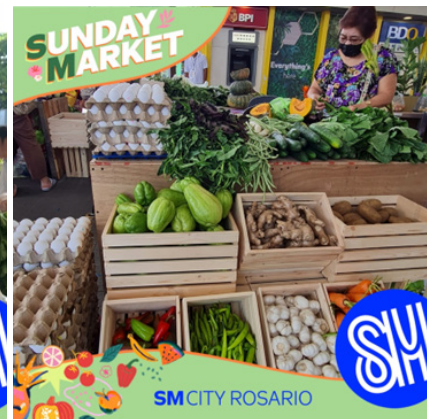
Fresh veggie soup for a healthier diet? Sautéed Sayote with egg and tomatoes can never go wrong! Get these freshly picked veggies every Sunday at SM Sunday Market.