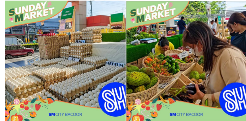
What could go wrong with Tortang Talong? Get the freshest, organic eggplants you can roast and made into eggplant omelette. You can also level up the dish with some fresh tomatoes, white or red onion, and bell peppers for a healthier and more flavorful viand.