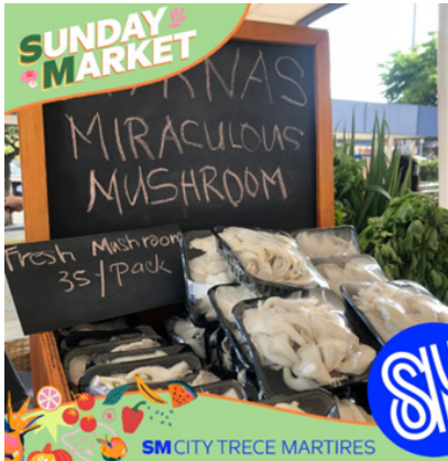
Craving for Sisig? Who knows you can make these SM Sunday Market fresh mushrooms into guiltless sizzling sisig? Cook these with fresh eggs, onion, garlic, and lots of chili for a more appetizing dish.