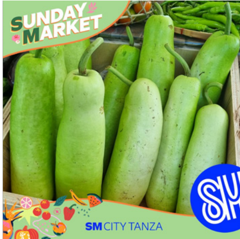
Who wants some soup to pair up with your fried fish or chicken? Get some fresh Upo or Bottle Gourd from the Sunday Market and saute them with egg, tomatoes, onion, and misua or vermicelli.