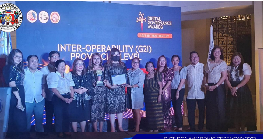
TAPAT SA BAYAN. TAPAT SA USAPAN. DICT: DGA AWARDING CEREMONY 2022 MARCH 30, 2023 WWW.CAVITEGOV.PH WWW.SONVICREMULLA.COM

"If this bridge is any indication of what comes next,