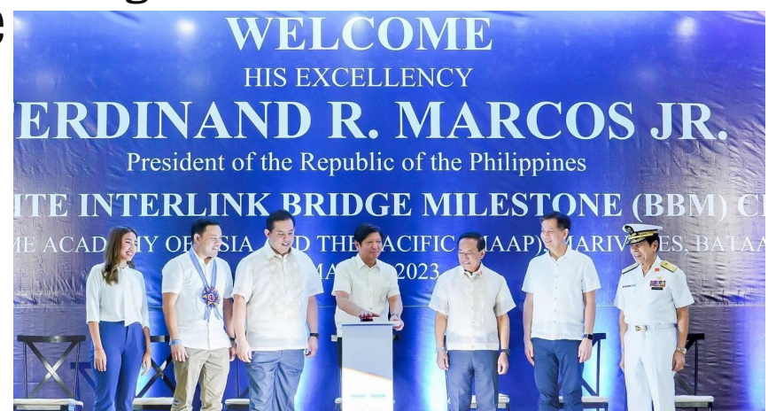
President Ferdinand Marcos Jr. leads the milestone ceremony for 32.15-kilometer Bataan-Cavite Interlink Bridge that stretches from Mariveles, Bataan to Naic, Cavite.

'If may extra ka, donate ka din': Cayetano hinikayat ang mga netizen na nangangailangan