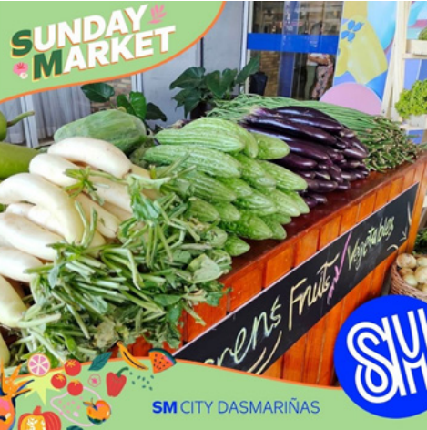
Who's bitter? Serve 'em some Sautéed Bitter Melon with egg from the fresh produce you can find at the SM Sunday Market.

Bored of the same old dishes? Make your family meal more exciting with these fresh ingredients you can find at the SM Sunday Market at SM City Bacoor, SM City Dasmariñas, SM City Rosario, SM City Tanza, and SM City Trece Martires. Brought to you directly by farmers from their farm to your table. If you're a mom who's running out of ideas for your next dish, try these five easy recipe with the freshest, and more affordable ingredients you can find at SM Sunday Market. You can also support your local farmers and give your family nutritious farm to table dishes. Stay tuned for more updates about the SM Sunday Market by visiting www.smsupermalls.com or following @smsupermalls on social media.