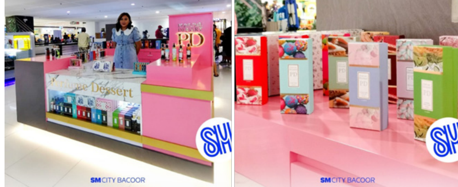
SM CITY BACOR, CAAVITE – Heads up connoisseur, Perfume Dessert London is now open at the Lower Ground Level, Service Lane of SM City Bacoor! Check out the best fragrances Parfum Dessert has to offer. Visit their store today and take home the scents you love for you and your loved ones.