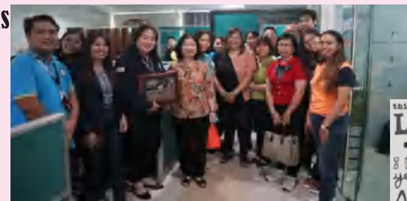
TYM visits the CMIT office to meet the IT providers behind the CARD MRI digitalization.

San Pablo City, Laguna - Thin Thuong One-Member Limited Liability Microfinance Institution (TYM), one of Vietnam's leading and first official microfinance institutions, visited CARD