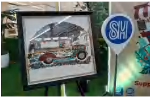
Coffee Art And Music at SM City Santa Rosa

SM City Santa Rosa and all SM Malls nationwide conducts Coffee Festival this month of July to highlight the vibrant coffee culture in the Philippines.