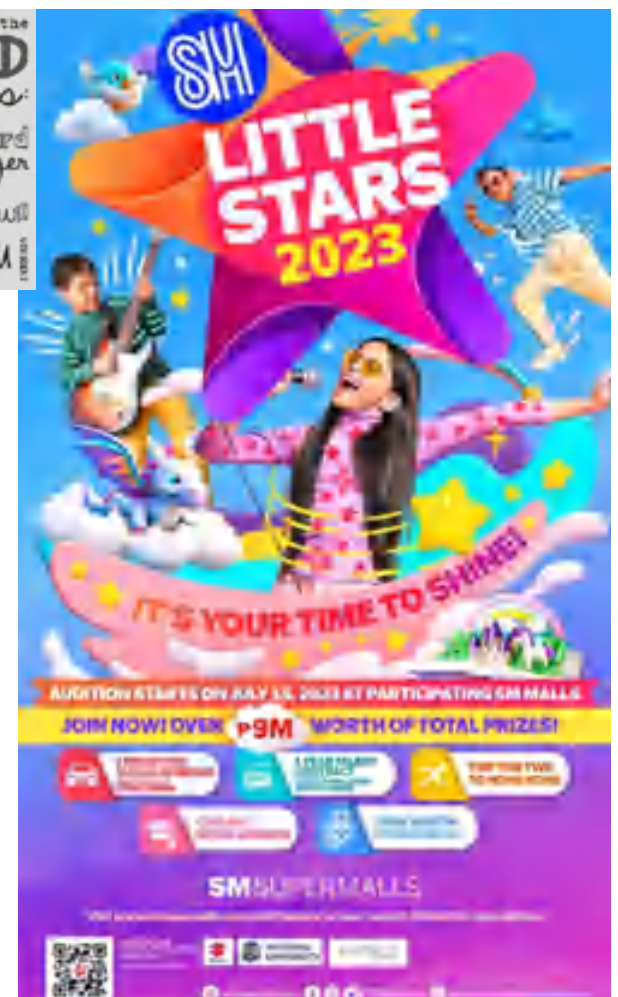
Let your kids shine the brightest at SM Little Stars 2023

LANDBANK ensures success of new law writing off P57.74-B agrarian debt Pag-IBIG Fund lowers home loan