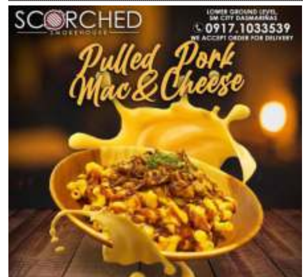
NEW AT SCORCHED SM CITY DASMARIÑAS!

grand celebration will kick off with the EK online store exclusive Eldar’s Birthday Treat promo of one (1) Regular Day Pass bundled with one (1) Eldar’s hat for a discounted price of 1,200 pesos. Guests can avail this promo exclusively at the EK Online Store until July 30 and experience the enchanting world of Eldar while donating this iconic hat until August 13. Eldar’s Birthday Bash Promo – July 30, 2023 Meanwhile, EK’s Eldar’s Birthday Bash promo entitles guests with access to Eldar’s Birthday Bash and one (1) EK Regular Day Pass on July 30 at the Enchanting Events Place. Guests will be captivated with the performances by Enchanted Kingdom characters and talented musicians, magicians, and dancers. Kids and adults alike will also enjoy facepainting and other fun and interactive games and activities. Eldar will also treat his guests with scrumptious snacks and give away magical souvenirs. To attend Eldar’s Birthday Bash promo on July 30, guests can book tickets from July 16 to 30 at the EK Online Store, Front Gate ticket booths, and Makati Sales Office. Non-members of the EK-sperience the Magic Card (EKMC) pay for only 1,500 while EKMC members can get this for only 500 pesos. For more information, guests can visit www.enchantedkingdom.ph or visit EK’s official Facebook page.