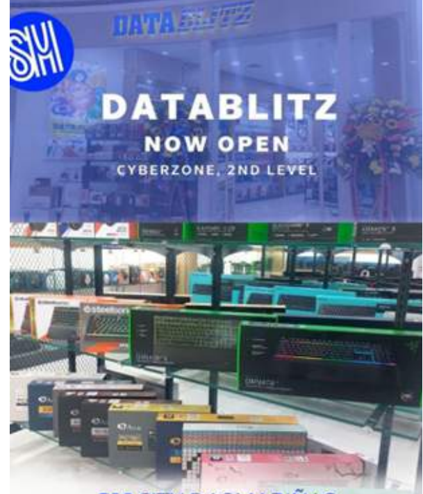
SM CITY DASMARIÑAS

Data Blitz is the new computer and gadget store at SM City Dasmariñas that offers variety of choices for your technology needs. Visit its store at Cyberzone, second level of SM City Dasmariñas.