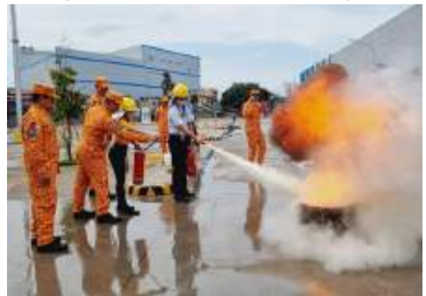
SM City Tanza employees were taught by BFP Tanza how to properly use fire extinguisher. SM Supermalls continue to improve and to enhance its safety measures and processes for a more safe malling experience.