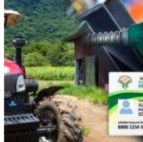
Aabot sa 11,789

na magsasaka ang maka- katanggap ng tig-tatlong libong pisong halaga ng suporta pang-gasolina sa pamamagitan ng Fuel As- sistance to Farmers Proj- ect (FAFP) ng Department of Agriculture IV-CALA- BARZON (DA-4A).