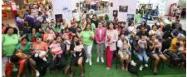
Mothers from Dasmariñas Green Ladies and partners from the public and private sector join hands with SM Cares in advocating for safe spaces for breastfeeding mothers with the Free to Feed photo exhibit and forum at (Mall Name)

In celebration of National Breastfeeding Month this August, SM Cares continues to promote breastfeeding awareness by mounting the "Free to Feed: Championing Safe Spaces for Breastfeeding at SM" forum and photo exhibit roadshow, launched at SM City Dasmariñas last August 16, 2023, together with Provincial Nutrition Office, Dasmariñas City Health Office and Dasmariñas Green Ladies.