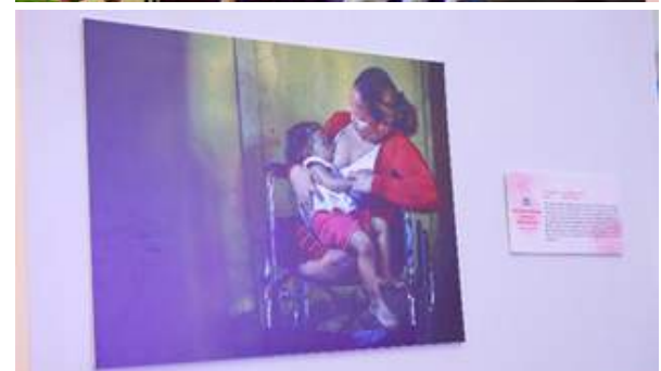
The Free to Feed forum and exhibit showcases the different stories of breastfeeding mothers and perspectives of their support groups in the public and private sector, as well as in their own homes and workplace

SM Supermalls provides accessible and safe spaces for nursing mothers through 80 breastfeeding stations available for customers and employees across SM malls nationwide. Earlier this month, SM Cares kicked off World Breastfeeding Week with sensitivity trainings for frontliners conducted by SM Mall Nurses to help create a welcoming environment for breastfeeding mothers. Dede-cation Perks are also available for mothers visiting breastfeeding stations in partnership with Baby Company, Watsons, Cetaphil, Dove and Sanfluo.