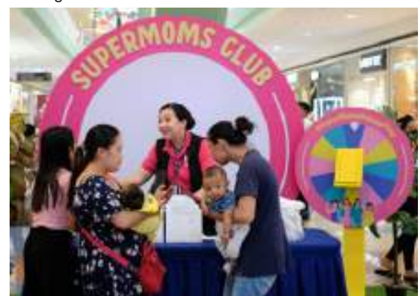
Mothers getting the DE-DEcation perks from the Supermoms Club booth during the event.

SM Supermalls provides accessible and safe spaces for nursing mothers through 80 breastfeeding stations available for customers and employees across SM malls nationwide. Earlier this month, SM Cares kicked off World Breastfeeding Week with sensitivity trainings for frontliners conducted by SM Mall Nurses to help create a welcoming environment for breastfeeding mothers. Dede-cation Perks are also available for mothers visiting breastfeeding stations in partnership with Baby Company, Watsons, Cetaphil, Dove and Sanfluo.