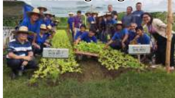
Batch 252 of farmer trainees during the harvest of their high-value organic crops in Brgy San Lucas 1, San Pablo Laguna.

A total of 75 farmers from Laguna are now equipped with new knowledge and skills about farming after they have completed the 14-week training of SM Foundation Inc.'s Kabalikat sa Kabuhayan (KSK) Farmers' Training Program. The KSK Farmers Training Program on Sustainable Agriculture recently culminated the activity with a bountiful harvest festival and graduation ceremony held at SM City Calamba, SM City San Pablo and SM City Santa Rosa. SM Foundation's Kabalikat sa Kabuhayan Program aims to upgrade the agricultural knowledge of small-scale farmers in order to produce quality, safe, high-value, and high-yielding fruits and vegetables while teaching them to become self-sufficient. With this program, SM is also giving opportunity for farmers to create market-linkages through SM Supermarket.