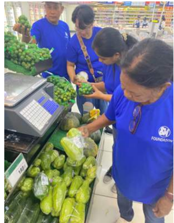
During the harvest and SM Markets tour of Batch 251 farmers from Brgy Banlic Calamba City, Laguna