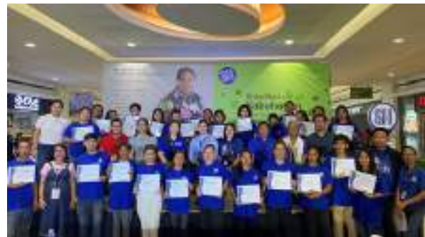
During the graduation rites of Batch 253-farmers from Brgy Tagapo, Sta Rosa held at SM City Santa Rosa