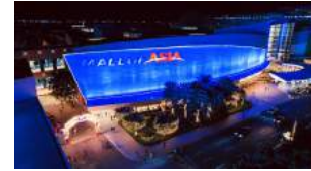
SM Mall of Asia

It's October and it only means one thing at SM- Super Month!