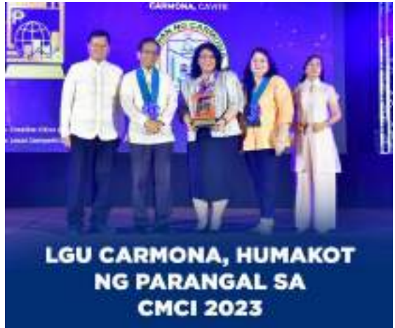
CARMONA | The Department of Trade and Industry (DTI) once again recognized the city of Carmona as Top 4 Most Competitive Municipality (1st to 2nd Class Municipality) in the just concluded Philippine Creative Cities and Municipalities Competitive Congress. In addition, they also bagged third place in various categories such as Economic Dynamism, Government Efficiency, and Innovation Pillar. Cities and Municipalities Competitiveness Index (CMCI) ranking measures the level of competitiveness in a province, city, or town based on four (4) pillars: Economic Dynamism, Government Efficiency, Infrastructure, and Resiliency. For this year, the theme of the Competitive Congress is "Building Creative Cities and Municipalities, Elevating Local Competitiveness".

Sa kauna-ahang pagkakataon ay ginanap sa Department of Agriculture IV- CALABARZON (DA-4A) ang Regional Civil Society Organization (CSO) Summit 2023 noong ika-25 hanggang ika-26 ng Setyembre sa Lipa City, Batangas. Ang mga kwalipikadong magpaakredit sa CSO ay mga Organisasyong Sibiko, Kooperatiba o Federation of Cooperatives, Non-Government Organization (NGOs), Peoples Organizations (POs), Indigenous Peoples Organizations (IPOs), Alliances/Network/ Federation of NGOs/Pos, Non-profit Organizations (NPOs) o Foundations na ang mga aktibidad ay may kinalaman sa agrikultura at pangingsisda. Ang akreditasyon ay magbibigay sa kanila ng akses at oportunidad na maging benepisaryo ng mga proyekto at programang ipinapatupad ng kagawaran. Binigyang pagkakataon ang mga katuwang na ahensya ng kagawaran sa rehiyon upang ilahad at ipaliwanag ang mga pangunahing programa at serbisyong hatid nila para sa mga magsasaka gayundin ang mga kaulalang requirements sa pag-avail ng mga ito. Kabilang dito ang Cooperative Development Authority (CDA), Department of Labor and Employment (DOLE), Department of Social Welfare and Development (DSWD), Department of cont. on page 2