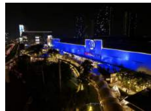
SM City North Edsa

Suit up for some super-sized deals, treats, and fun as SM celebrates its 65th anniversary. Check out the month-long festivities filled with spectacular activities, immersive attractions, and unforgettable experiences that will leave you thrilled and excited.