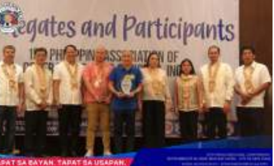
The Philippine Association of General Services Officers, Inc. - Cavite Chapter hosted the 15th Regional Conference of the Philippine Association of General Services Officers, Inc (PAGSO) held on September 27-29, 2023 at the Bayleaf Hotel, City of Gen. Trias. The conference proved to be a remarkable gathering of government service professionals dedicated to improving public administration and procurement. This year's theme, "Consistency and Resiliency Amidst Adversity" set the tone for insightful discussions, engaging workshops, and networking opportunities. cont. on page 6