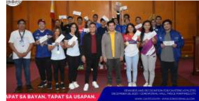
placed on every achievement, underscoring the importance of hard work, dedication, and sportsmanship.

The substantial prizes serve as both a token of appreciation and a source of motivation for these athletes to continue pushing their boundaries and inspiring the youth of Cavite to pursue excellence in sports. The acknowledgment likewise emphasizes the value