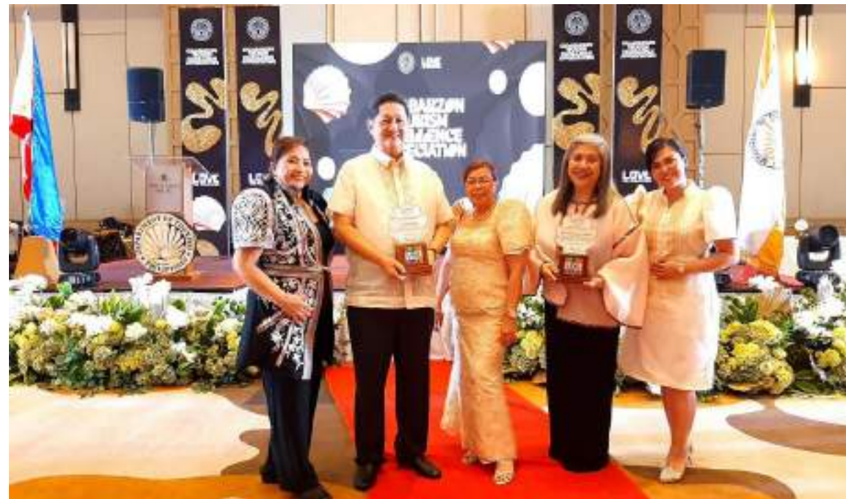
EKsperience, the first and only flying theater in the Philippines celebrating the beauty of the Philippines' destinations, products, and people. For 28 years, Enchanted Kingdom has been ar-dent in promoting tourism and products in the region. PR