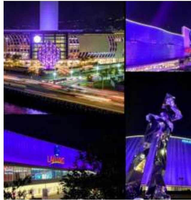
SM Mall of Asia Official, SM City North Edsa, SM ME-GAMALL. SM Aura. SM Seaside City Cebu (Official), and SM Lanang all turn purple to kick off National Women's Month and supporting United Nations Philippines, Philippine Commission on Women, and WIN DRR Philippines, together with SM Cares in creating #SafeSpacesAtSM and building a future where every woman can reach her full potential!