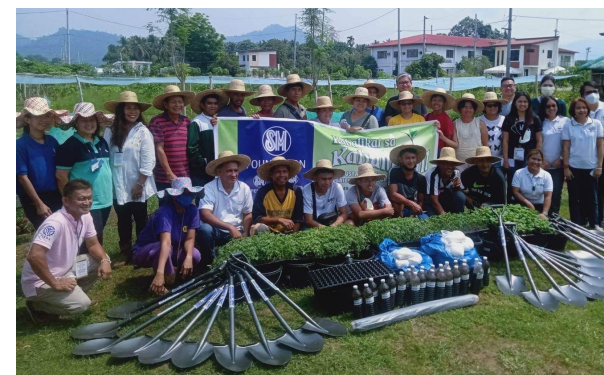
KSK-SAP farmers and partners from San Pablo City, Laguna.

SM Foundation, Inc. (SMFI) has taken another step in its mission to enhance the agricultural and entrepreneurial skills of farmers. The organization recently launched the Kabalik sa Kabuhayan on Sustainable Agriculture Program (KSK-SAP) across various locations in Calabarzon.