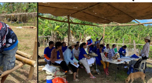
KSK Trainees at Tabangao Ambulong, Batangas City, Batangas

As a highlight of the program's first phase, KSK-SAP farmers will join the SM Sunday Market, a collaborative initiative between SM Foundation and SM Supermalls. This platform offers trainees a valuable opportunity to showcase their agricultural produce and gain firsthand experience in institutional selling. Through