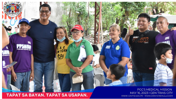
PCCS MEDICAL MISSION MAY 16, 2023 | GEN. TRIAS CITY

As the KMME Program celebrates its 5th year of implementation, the importance of monitoring the depth and breadth of its coverage and evaluating its efficacy, outcomes and results cannot be overstated. For the program stakeholders to take stock of successes, lessons learned and recommendations for further improvement, a proper Monitoring & Evaluation (M&E) of the entire program will duly document and objectively study its results. Likewise, a celebratory material in the form of a coffee table book would ably showcase the five-year run of the KMME Program. PR