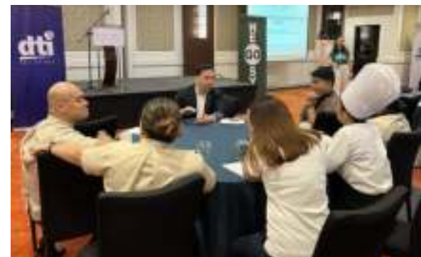
A mentoring session during the two-day entrepreneurship mentoring program last June 10 and 11, 2024 for the displaced employees of Sofitel Philippine Plaza. The program is supported by Go Negosyo, the DTI, DOLE and SSS

The POGO industry has been under intense scrutiny due to its association with various illegal and criminal activities, including money laundering, human and sex trafficking, tax evasion, and online scamming.