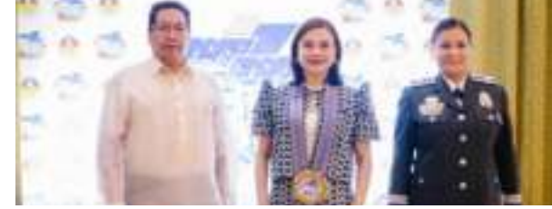
The Bureau of Jail Management and Penology (BJMP) marked its 33rd Anniversary with a grand ceremony dedicated to honoring outstanding contributions to public service and safety. Among the distinguished honorees was the City Government of

PCS-04-024827; LOT 2534 (RS-04-004834); LOT 2536 (RS-04-004717) & LOT 2540 (RS-04-002857) ALL OF SAN FRANCISCO DE MALABON ESTATE L.R.C. RECORD NO. 5964) SITUATED IN THE BARANGAY OF SANTIAGO, MUNIPALITY OF GEN. TRIAS, PROVINCE OF CAVITE, ISLAND OF LUZON. BOUNDED ON THE SE., ALONG LINE 1-2 BY ROAD LOT 4; ON THE SW., ALONG LINE 2-3 BY LOT 28, BLK 55; ON THE NW., ALONG LINE 3-4 BY LOT 20, BLK 55; ON THE NW., ALONG LINE 4-5 BY LOT 19, BLK 55 AND ON THE NE., ALONG LINE 5-1 BY LOT 30, BLK 55 ALL OF THE CONSOLIDATION AND SUBDIVISION PLAN. BEGINNING A POINT MARKED "1" ON PLAN, X X X CONTAINING AN AREA OF THIRTY SIX (36) SQUARE METERS, MORE OR LESS X X X