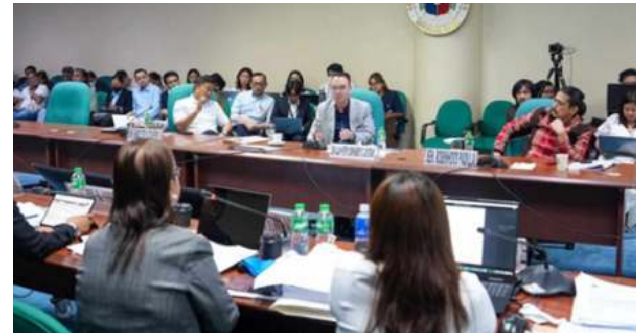
The Senate Committee on Accounts conducted a public hearing to review the construction of the New Senate Building (NSB) on Wednesday, July 3, 2024, seeking answers from the Department of Public Works and Highways (DPWH) about the project's plans, costs, and projected completion date. "We aim for the best quality at minimal cost—a symbol of the people's voice and democracy. No one said na may anomalya, nagulat lang kami sa presyo and that's why we're reviewing this," said Senator Alan Peter Cayetano, Chair of the Senate Committee on Accounts.