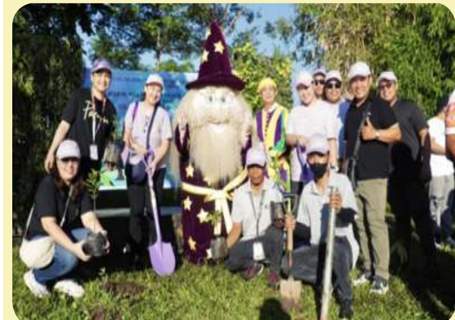
As a testament to EnchantedKingdom's commitment towards environmental awareness, sustainability and working with local communities, EldarTheWizard and EK Cast Members (CMs) joined hand in hand with the City Government of Santa Rosa, Save Silang-Santa Rosa River (S3R2) Foundation, and Nuvali during a tree planting activity at the Rain Garden, Nuvali, City of Santa Rosa last June 29.

The S3R2 Foundation is formed by various businesses, NGOs, and LGUs in Silang, Cavite, Binang City, and City of Sta. Rosa and aims to contribute to the re-greening and rehabilitation of the threatened Silang-Santa Rosa Sub Watershed. EK is an active member and is designated as the Secretary among its set of officers. Eldar and EK CMs surely enjoyed sharing their magic towards this enchanting activity.