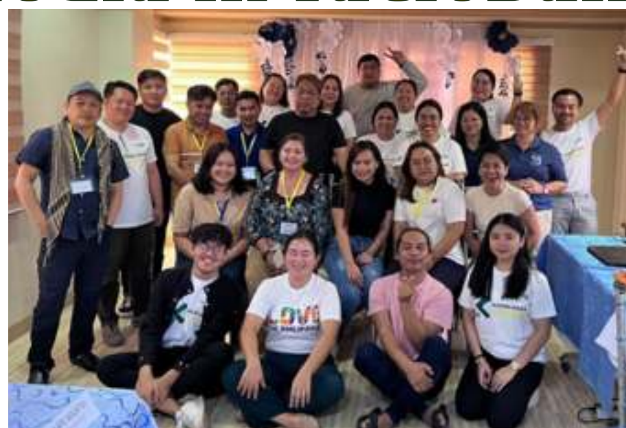
Media participants and CARD MRI key officers gathered for a media briefing to conclude the three-day Panaghiusa CARD MRI Exposure Tour program.

Led by CARD MRI Publishing House, the media participants visited the centers and clients of CARD, Inc. (A Microfinance NGO) and CARD Bank Tacloban Branch where they learned the stories of suc-