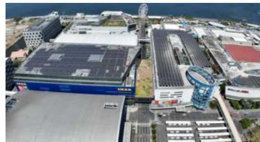
More than 3,600 solar panels were installed on the roof of MOA Square in the Mall of Asia Complex.

Designed with a power yield of 3,000 Megawatt-hour (MWh) of electricity annually, the solar partnership project has over 3,672 PV panels installed and is expected to provide huge cost savings for SM Prime. Located at the MOA Square in the Mall of Asia Complex,