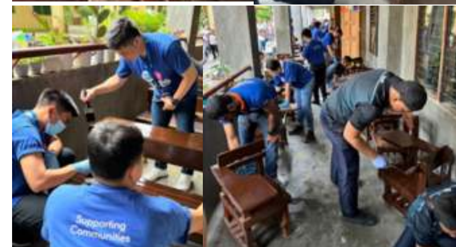
SM City Dasmariñas and SM Marketmall employees, along with agency personnel, participate in Brigada Eskwela 2024 at Paaralang Sentral ng Dasmariñas II under the theme "Bayanihan para sa matatag na paaralan." They contribute by painting, cleaning, and repairing classrooms, as well as donating books to support the children.