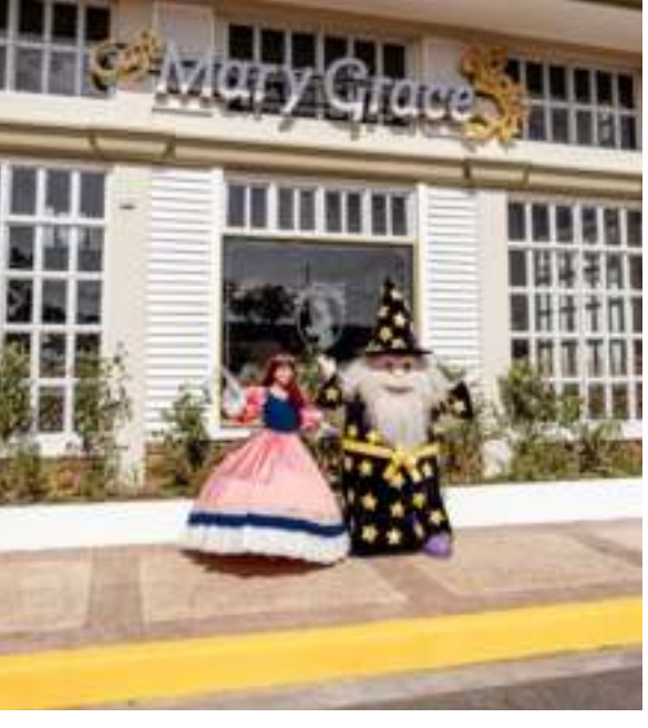
Enchanted Kingdom, the world-class theme

park in the Philippines, partners with Filipino park is closed. brand Cafe Mary Grace