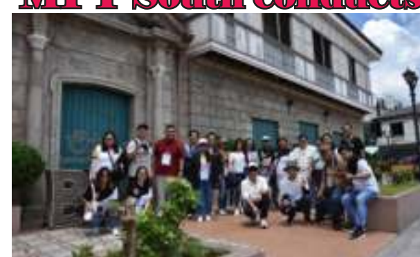
MPT South Photowalk 1: MPT South together with invited photo enthusiasts, media partners, representatives from Department of Interior and Local Government - Laguna (DILG Laguna), Laguna Tourism Culture Arts and Trade Office (LTCATO), Biñan City Culture, History, Arts, and Tourism Office (BCHATO), Sta. Rosa Tourism Office (SRTO).

Metro Pacif- the mother of the country's ic Tollways South (MPT national hero, Dr. Jose South), in collaboration Rizal. They also seized with the Department of the moment, learning the Interior and Local Gov- footprints of Dr. Rizal's ernment - Laguna (DILG maternal and paternal lin-Culture Arts and Trade Of- city center. fice (LTCATO), Biñan City Culture, History, Arts, and the city of Sta. Rosa, the Tourism Office (BCHATO), and Sta. Rosa Tourism Of- pleased with the homey fice (SRTO) successfully culminated its first Bivaheng South's "Discover Sta. Rosa's oldest restau-Laguna: A Heritage Photo rant. After the luncheon, Walk Tour" in Biñan and they were briefed by the