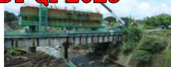
CALAX Open Canal Interchange: Construction in Subsection 3, Open Canal Interchange