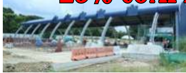
Governor's Drive Toll Plaza Construction progress