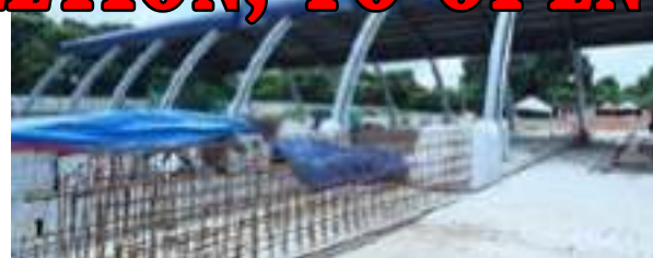
Governor's Drive Toll Plaza Construction progress