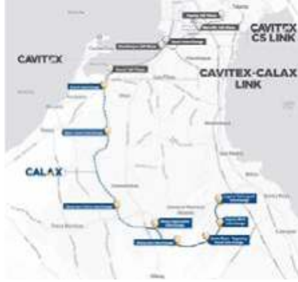
CALAX Road Network Map: CALAX Road Map (Operational from Laguna technopark interchange to Silang Aginaldo; Under construction from Silang Aginaldo to Kawit Interchange)

guna Boulevard, Santa Rosa-Tagaytay Road, Silang East, and Silang (Aguinaldo) Interchange, with remaining segments Governor's Drive, Open Canal and Kawit still in construction. When fully completed, CALAX will reduce travel time from