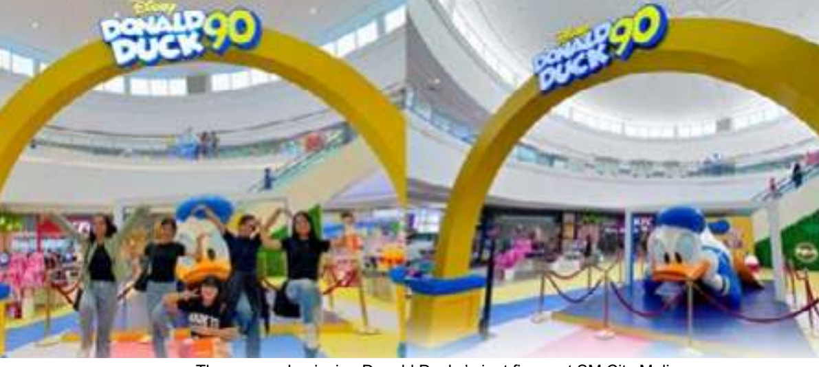
These squad enjoying Donuld Ducks' giant figure at SM City Molino