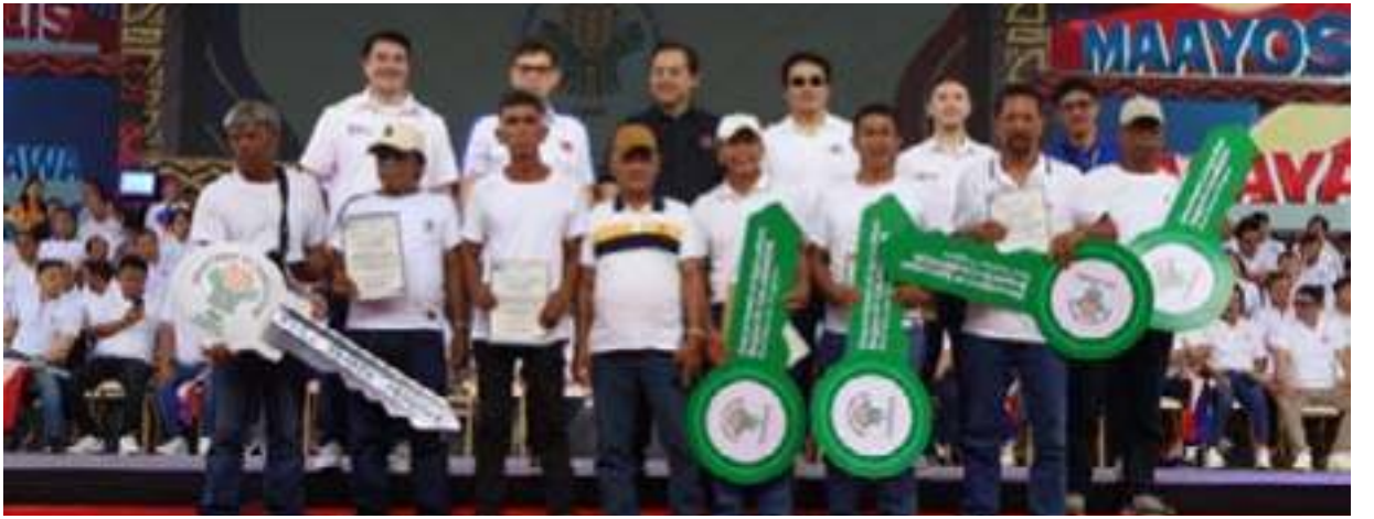
milyong piso ang mga magpapalay na benepisyaryo mula sa Batangas sa ginanap na ceremonial distribution ng BPSF

Tumanggap ng 5 unit ng combine harvester na nagkakahalaga ng 10