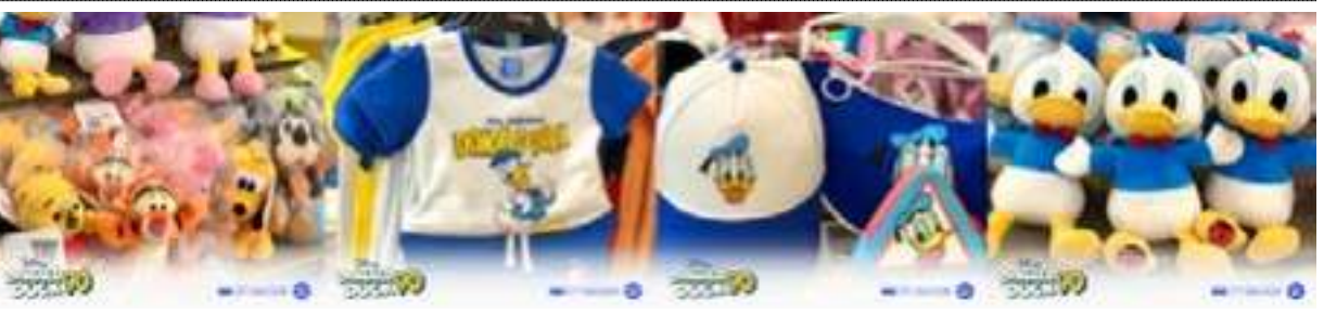
Hurry and add up these items on your Disney collectibles. Grab these merch at the Event Center of SM City Bacoor after you snap your IG photo with Donuld Duck

The celebration continues from SM City Molino to SM City Bacoor! Join the grand celebration of Donald Duck's 90th birthday this weekend at SM City Bacoor's Event Center. Fans of all ages are invited to commemorate the beloved Disney character by taking snaps at this giant photo spot until September 22 only. Don't miss out on Donald Duck and other collectibles. perfect for adding to your Disney collection. Bring your family and friends to share in the joy and celebrate this milestone in style! See you at SM City Bacoor this weekend!