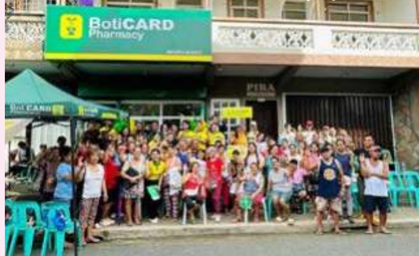
The Infanta community celebrated the new expansion of BotiCARD in their community. The clients received free health and wellness checkups as part of the institution's mission to meet the medical needs of our countrymen.

The pharmaceutical arm of CARD MRI, BotiCARD, Inc., opened its new pharmacy in Infanta, Quezon on June 28, 2024. This expansion is significant to fulfill the pharmacy's goal of giving communities access to high-quality healthcare products and services.