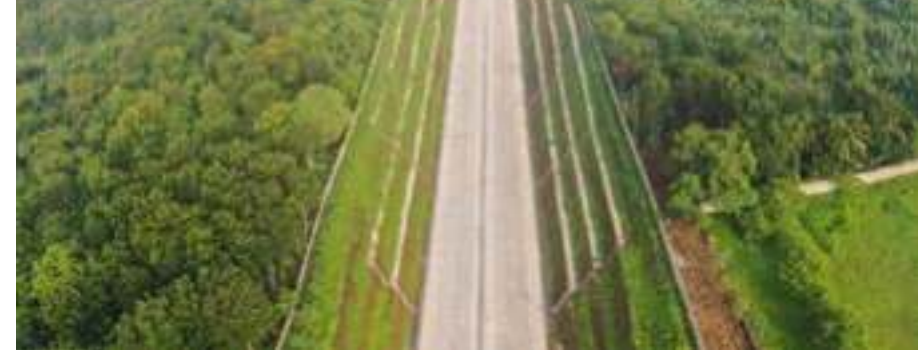
lac Expressway (SCTEX), NLEX Connector Road, and Cebu-Cordova Link Expressway (CCLEX) in Cebu.

MPT South is a subsidiary of Metro Pacific Tollways Corporation (MPTC), the infrastructure arm of Metro Pacific Investments Corporation. In addition to CAVITEX and CALAX, MPTC also holds concession rights for North Luzon Expressway (NLEX), Subic-Clark Tar-