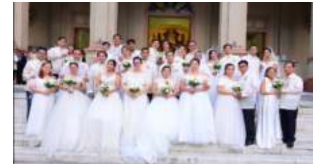
The 8th Kasalan sa SM, a heartwarming mass wedding, is held at the Shrine of Jesus the Way, the Truth and the Life Church in Pasay City.