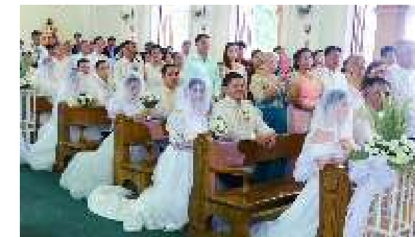
16 couples, including members of the SM SuperMoms Club Facebook community, SM employees, and members of the public, participate in the mass wedding.