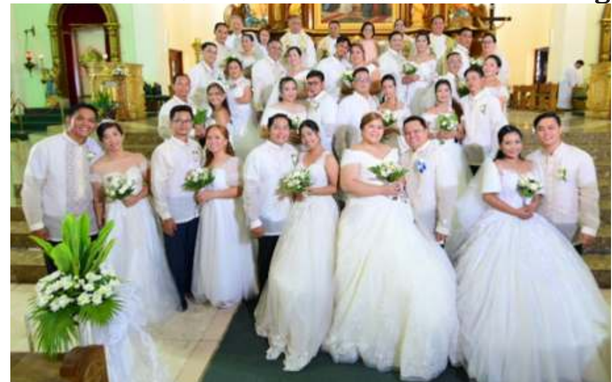
SM Supermalls and the Felicidad T. Sy Foundation, Inc. (FTSFI) bring together 16 couples, including SM SuperMoms, at the heartwarming 8th Kasalan sa SM mass wedding.

The 8th Kasalan sa SM mass wedding, officiated by clergy members, brought joy and blessings to the newlyweds who celebrated their union with loved ones. This event not only strengthens the bond of marriage but also underscores SM Group's commitment to upholding Filipino Catholic faith and fostering strong family values within the community.