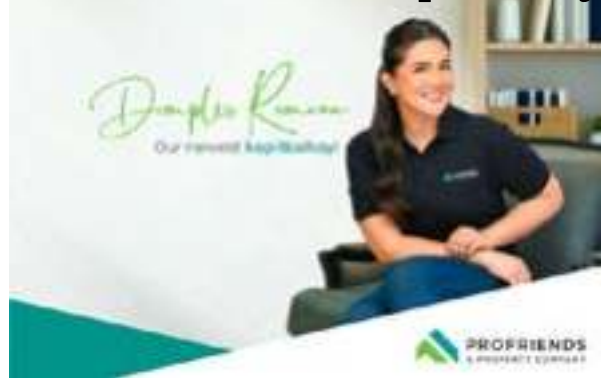
Dimples Romana, our newest kapitbahay!

Given the rising value of land in Cavite, Profriends has recently conceptualized a different kind of condo living that is true to what it stands for. Westwind at Lancaster New City and Lamore at Micara Estates in Tanza are low-rise vertical projects that consider open