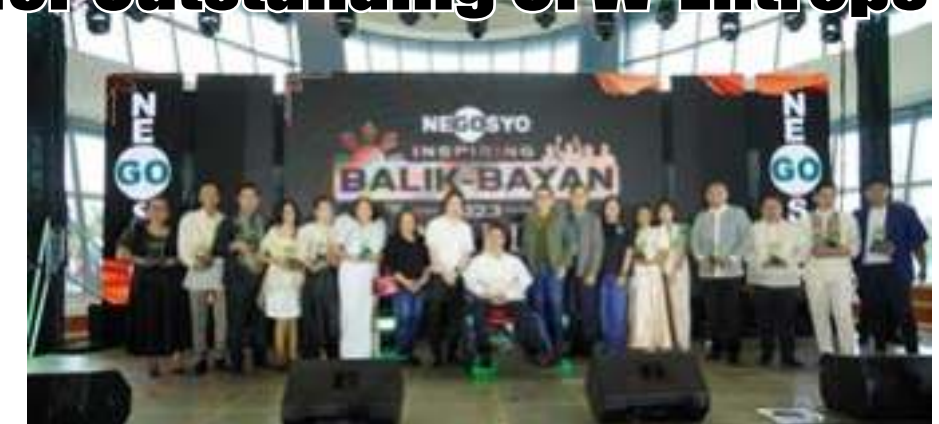
Go Negosyo Balik-Bayan 2023 Awardees