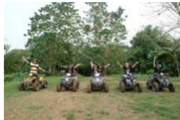
ATV in action at Paraiso de June Quixote