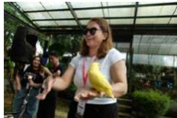
Animal encounter at Yoki's farm