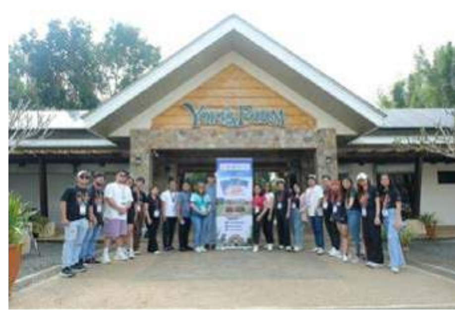
Adventure at Yoki's Farm