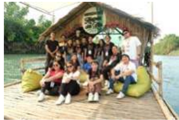
Adventure at Alegria del Rio, Maragondon River Cruise