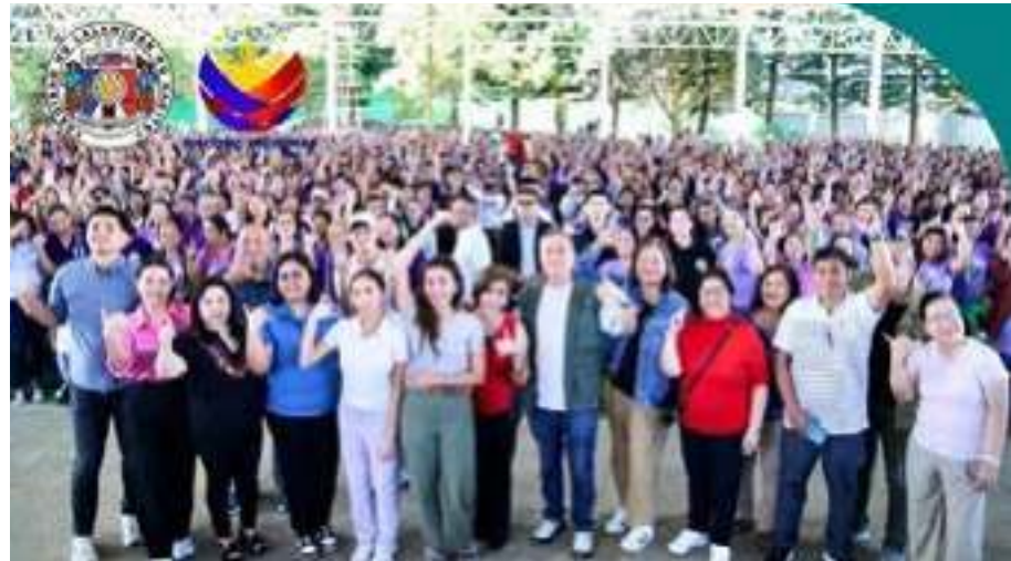
Today in Tagaytay City, Governor Athena Tolentino led another leg of the Women's Welfare Pro-

DATELINE WEEKLY NEWSPAPERS: Nov. 25, Dec. 2 & 9, 2024