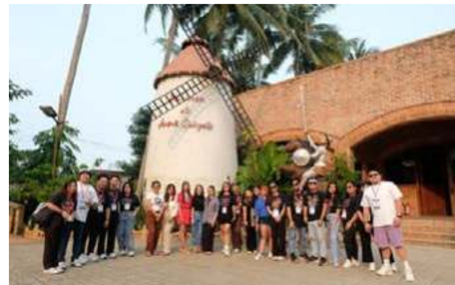
Adventure at Paraiso de June Quixote