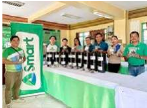
PLDT and Smart donates #PlantSmart kits to Leonard Young Sr. National High School in General Santos City.

Kit includes essential materials such as seeds, a bucket, nutrient solution, hydroton, and rockwool. The kit is perfect for using the Kratky method, a hydroponic technique where the plants are suspended above a covered container of nutrient-rich water, making it an almost hands-off endeavor.