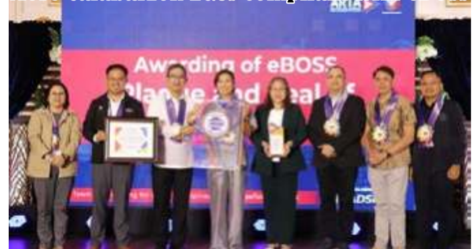
At least 13 local government units across the Calabarzon region out of the 35 LGUs nationwide are compliant with the electronic Business One-Stop Shop (eBOSS) program, the Anti-Red Tape Authority (ARTA) said. (CH/PIA-Laguna)

CALAMBA CITY, Laguna (PIA) – At least 13 local government units across the Calabarzon region are compliant with the electronic Business One-Stop Shop (eBOSS) program, the Anti-Red Tape Authority (ARTA) in Southern Tagalog said.