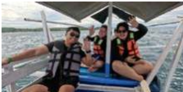
Island Hopping and Snorkeling at CaSoBe

ic Tollways South (MPT South) concessionaire of the Cavite-Laguna Expressway (CAL-AX) and Manila-Cavite Expressway (CAVITEX) marks another milestone with its flagship tourism advocacy campaign – Biyaheng South with its Summer Tour campaign.