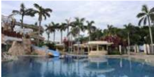
Water-filled fun at Aquaria Water Park Metro Pacific