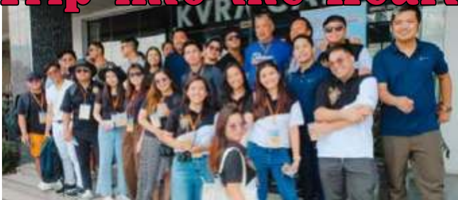
Breakfast and coffee at Kura Café