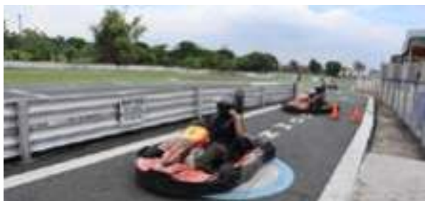
Ka-Biyaheros racing at Carmona Racetrack

Biyaheng South Summer tour boasts of an immersive adventure showcasing Southern Luzon's finest summer destinations. This year's event is co-presented by Landco Pacific Corporation, in partnership with Department of Tourism Region IV-A (DOT IVA), Department of Interior and Local Government Region IV-A (DILG-IVA), Cavite Tourism Office and Calatagan Tourism Office. A select group of influencers, media partners, and lucky winners from the Summer Tour promotion—known as Ka-Biyaheros—were invited to experience these destinations firsthand, and who will then continue to promote these sites by sharing their journey across their social media channels. Foton Philippines served as the official mobility partner, providing Ka-Biyaheros with comfortable rides, and the event is also sponsored by