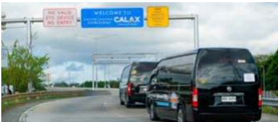
FOTON Traveller and FOTON Traveller XL cruising at CALAX

The participants then headed to Kura Café in General Trias, Cavite, which is just a short drive from CALAX Silang-Aguinaldo exit. The group was welcomed with specialty brews and morning pastries while basking in the charm of this local favorite. One of the café's best sellers is their pizza, specifically the Nutella with pistachios—a delightful fusion of sweet and savory. Other must-try dishes in their menu are beef quesadilla, oyster sisig, baked scallops, and banana bread.