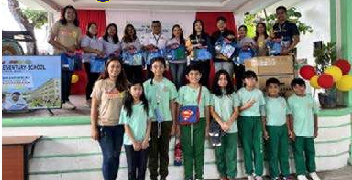
Alapan II-A Elementary School receives school kits from MPT South

Demonstrating its steadfast commitment to community development, Metro Pacific Tollways South (MPT South) actively participated in the Department of Education's Brigada Eskwela 2025 "Brigada Eskwela: Sama-sama Para sa Bayang Bumabasa" by donating 900 school supply kits to public schools across Cavite and Parañaque on June 9 to 11, 2025, in preparation for the upcoming 2025-2026 academic year. The initiative, which aims to support students and ease the financial burden of families in preparation for the incoming school year, reached various schools in the cities and municipalities of Imus, Silang, General Trias, Kawit, Bacoor, and Parañaque: Alapan II-B Barangay Hall, Mala-