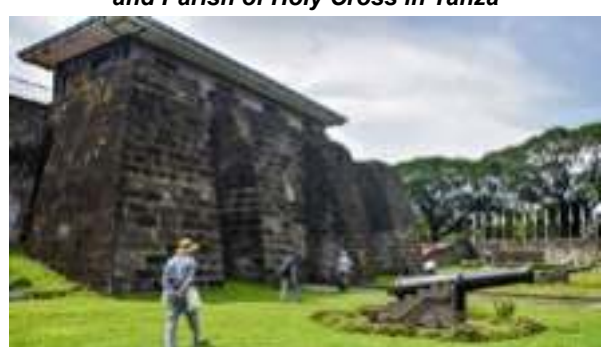
The historic Fort San Felipe in Cavite City