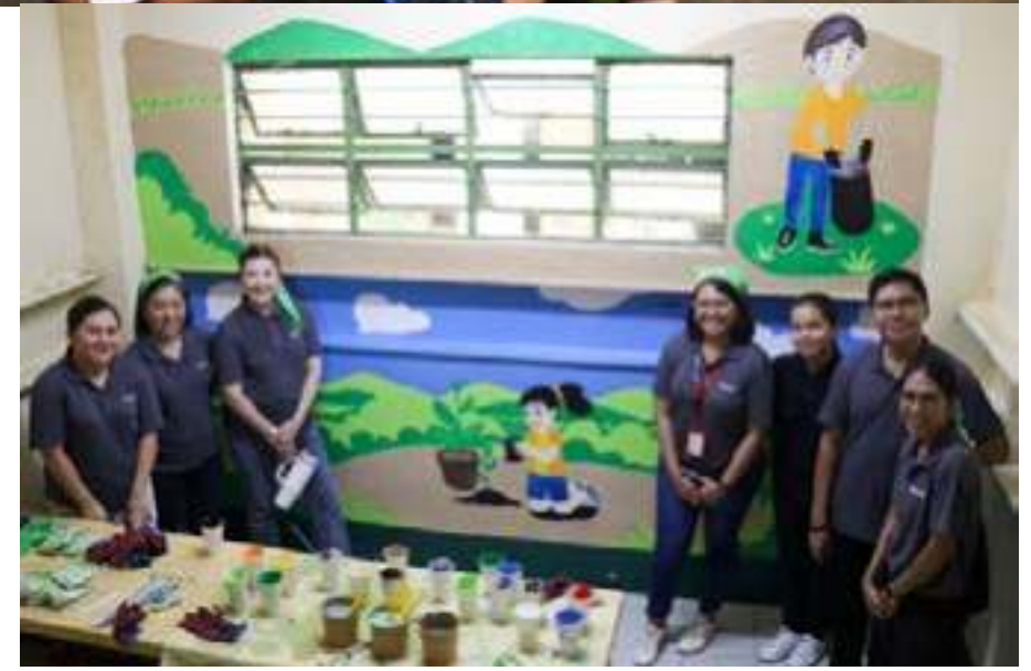
WALL WITH A PURPOSE: Volunteers from the Aboitiz Foundation painted a mural depicting love for the environment to inspire students to do their share in keeping their community clean

For several Aboitiz Future Leaders scholars, Brigada Eskwela offered a full-circle moment-an opportunity to give back to public schools demic journeys.