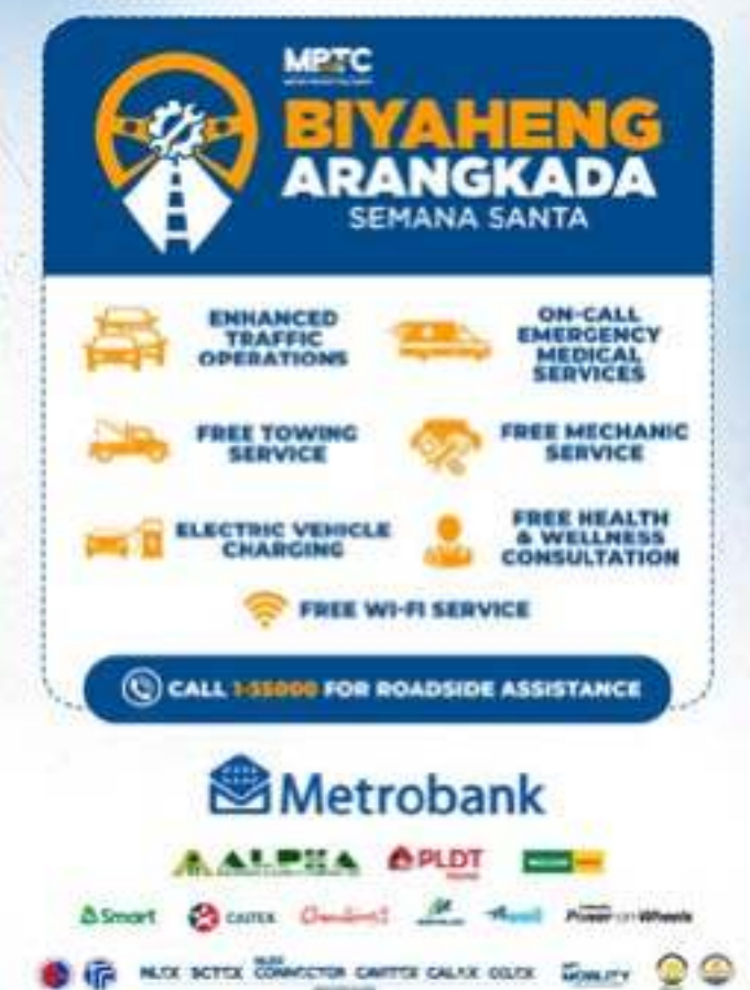
MPTC Biyaheng Arangkada