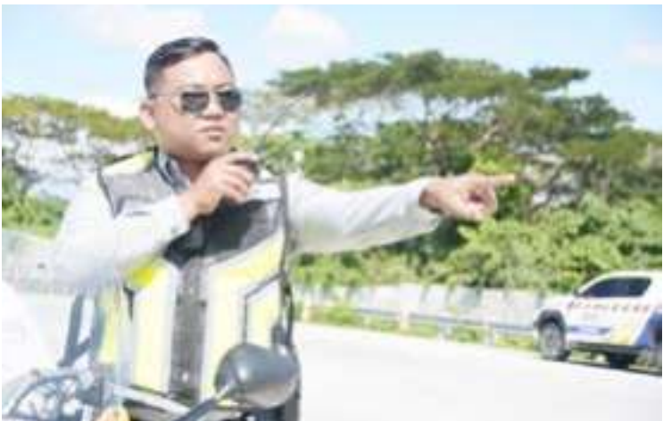
CALAX Patrol crew on-duty