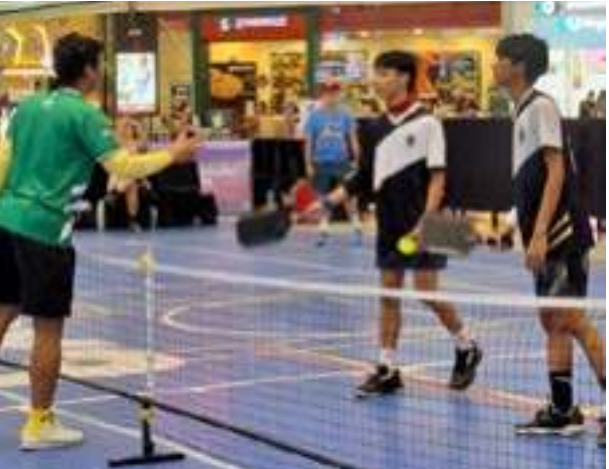
Pickleball can be played as singles (one-on-one) or doubles (with a partner), making it a versatile and engaging sport for all players.

With Pickleball gaining popularity in the Phil-