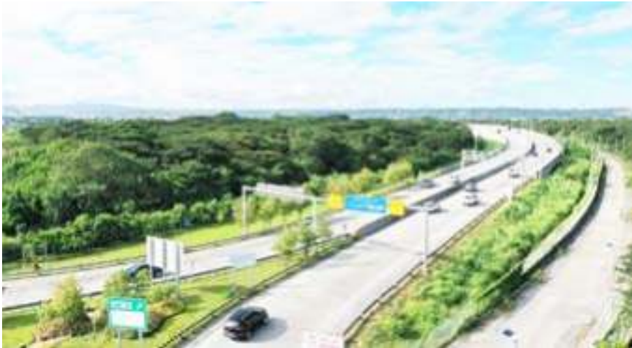
Cavite-Laguna Expressway Entry