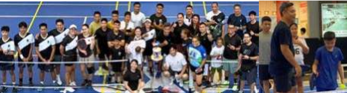
Pickleball groups in Cavite came together to experience the excitement of Pickleball at SM Active Hub in SM City Rosario, enjoying the sport in a fun and dynamic mall setting.