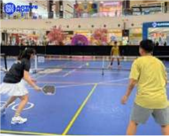
Experience a whole new level of excitement as you play Pickleball at SM Active Hub, SM City Rosario!

As part of SM Supermalls Active Hub, Pickleball is bringing fun and fitness to SM City Ro-sario! Enthusiasts from various Cavite groups joined the action, enjoying this fast-growing sport that blends tennis, badminton, and table tennis.