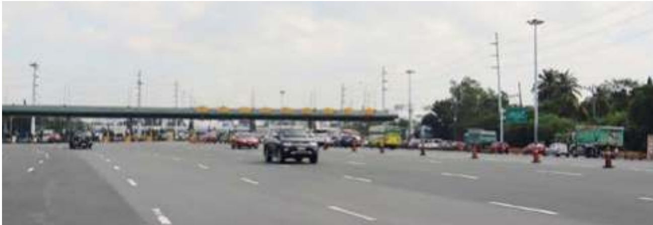
CAVITEX Paranaque Toll Plaza