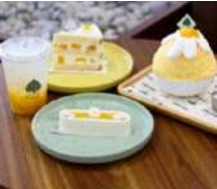
Summer just got sweeter at After Tree SM City Trece Martires!

Don't wait—this promo ends on April 28, 2025! Visit AMA COFFEE at 2nd level of SM City Tanza.