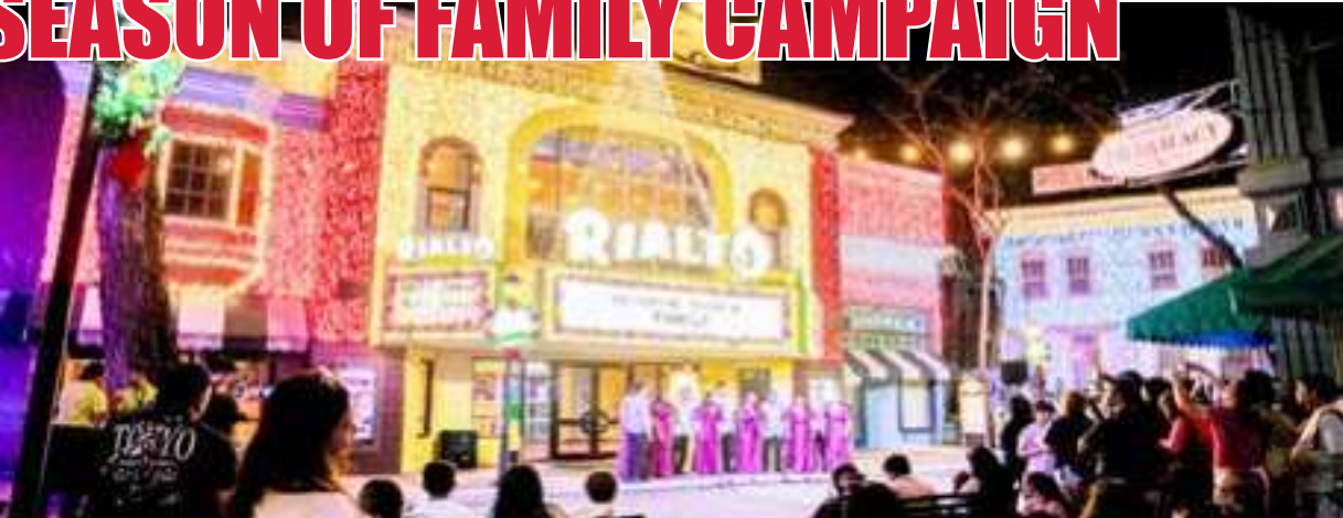
EK Magical Pre-Christmas Event