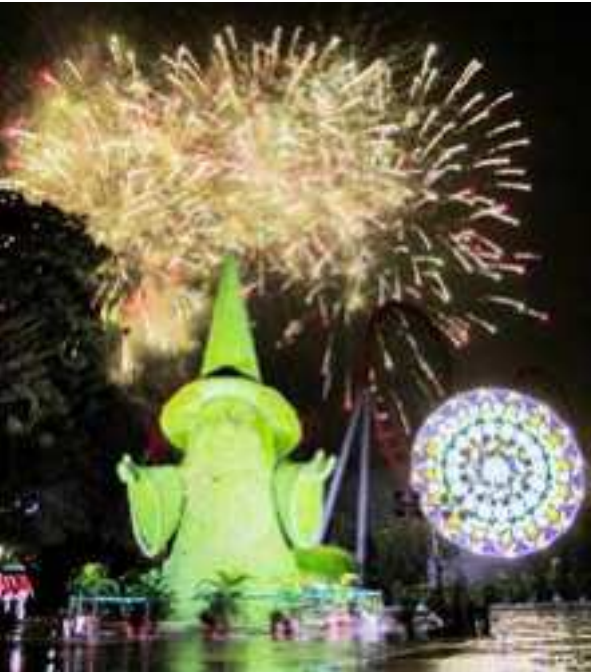
EK Eldar's Evergreen Topiary, Grand Parol, Forever Enchanted Fireworks Show