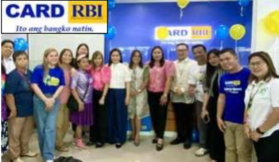
CARD RBI heads, staff, and clients, along with CARD MRI Senior Advisers, unite to commemorate the institution's 13th founding anniversary.

“As we look to the future, we remain dedicated to enhancing our workforce's capabilities and adopting cutting-edge technology to deliver quality banking services that adapt to the evolving needs of the communities we serve,”