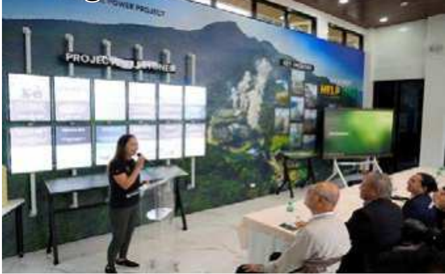
DOE Secretary Garin cites MGPP's unique compact design enabling baseload supply with minimal environmental footprint.

Sto. Tomas, Batangas, December 22, 2025 – Department of Energy (DOE) Secretary Sharon S. Garin led the formal opening of Maibarara Geothermal Inc. (MGI) Visitor Center located inside the Maibarara Geothermal Power Facility (MGPF) complex in Sto. Tomas, Batangas, attended by MGI partners PetroGreen Energy Corporation (PGEC), ACEN, and PNOC-Renewables Corporation (PNOC-RC). PGEC is a joint venture