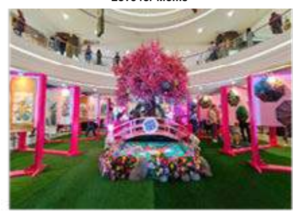
One of the event's highlights is a luminous tree, adorned with hand-pointed hanging lamps and surrounded by moving flowers, butterfies and live animations of waterfall and koipond paintings-creating a breathtaking sensory display