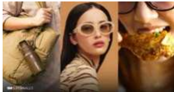
All For Our Foodie Stans

We are all about that stan life. A new album from a rising artist? Fan-boy/fangirl mode activated. A freshly opened concept store? Consider us a fan. Entering your fitness era? Support. Whether it's a personality we love or a lifestyle we aspire to, as long as it resonates with the life we want, we are stanning hard.