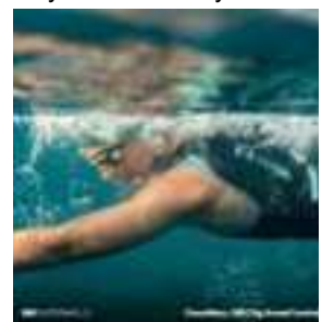
All For Our Wellness Stans

is the perfect spot to savor the familiar flavors of the country.