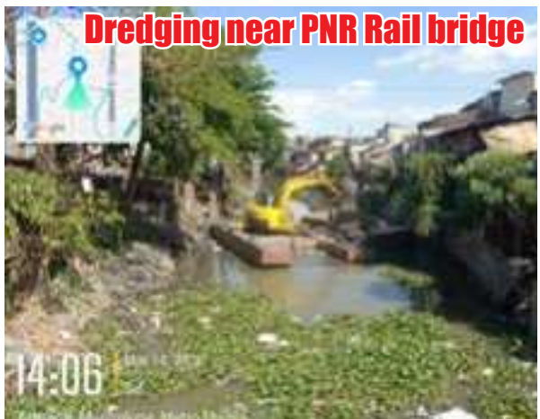
Dredging near PNR Rail bridge

ter Rivers PH operations in the Las Piñas River system (Las Piñas and Zapote rivers), covering 1.84 kilometers, with a total of 179,558 metric tons of dredged silt and waste removed; the Parafaque River system, span-