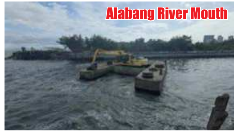
Alabang River Mouth