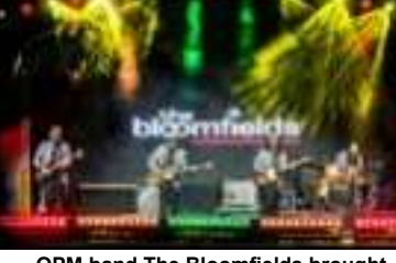
OPM band The Bloomfields brought nostalgia at EK's The Legend Shines Again! Wheel of Fate Relaunch with their classic hits

Park's operational days from 12PM to 8PM, alongside EK's other attractions and experiences.