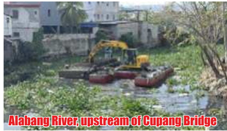
Alabang River, upstream of Cupang Bridge

of this critical waterway progresses, well ahead of the rainy season.