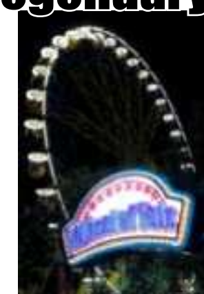
Enchanted Kingdom's legendary Wheel of Fate officially shines again after its grand relaunching last March 21, Saturday