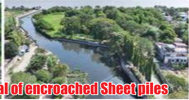
Relocation of ISFs and removal of encroached Sheet piles