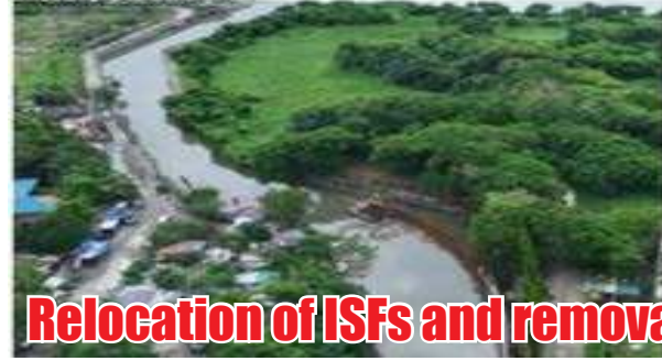
Before: July 2025