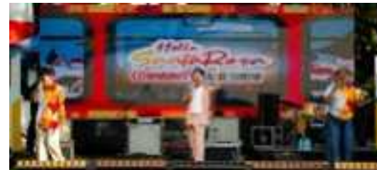
Lion City Youth Inc. launched its Hello Santa Rosa teaser at EK's The Legend Shines Again! Wheel of Fate Relaunch