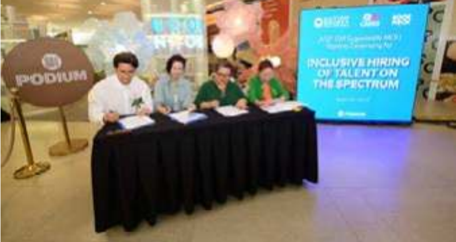
Strengthening our commitment to a more inclusive community, SM Supermalls and ASP sign the Memorandum of Understanding for Inclusive Hiring of talents on the spectrum.