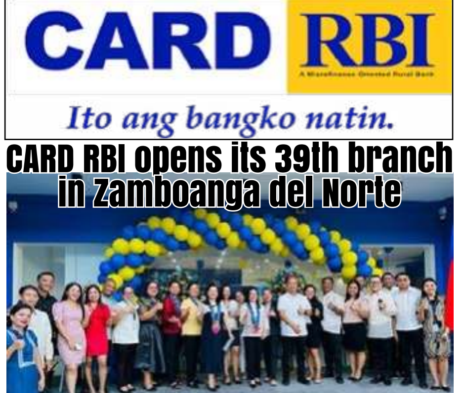
Leading the way to financial inclusion, CARD RBI opens its 39th branch in Sindangan, Zamboanga del Norte.

Bank, Inc. (CARD RBI), a 2025. microfinance oriented-rural bank under CARD MRI opened its 39th branch in opening of a new branch; cont. on page 6 Sindangan, Zamboanga