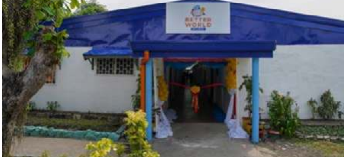
The Better World Bilibid is a newly renovated school building which now features upgraded learning facilities — among them a fully-equipped computer room.