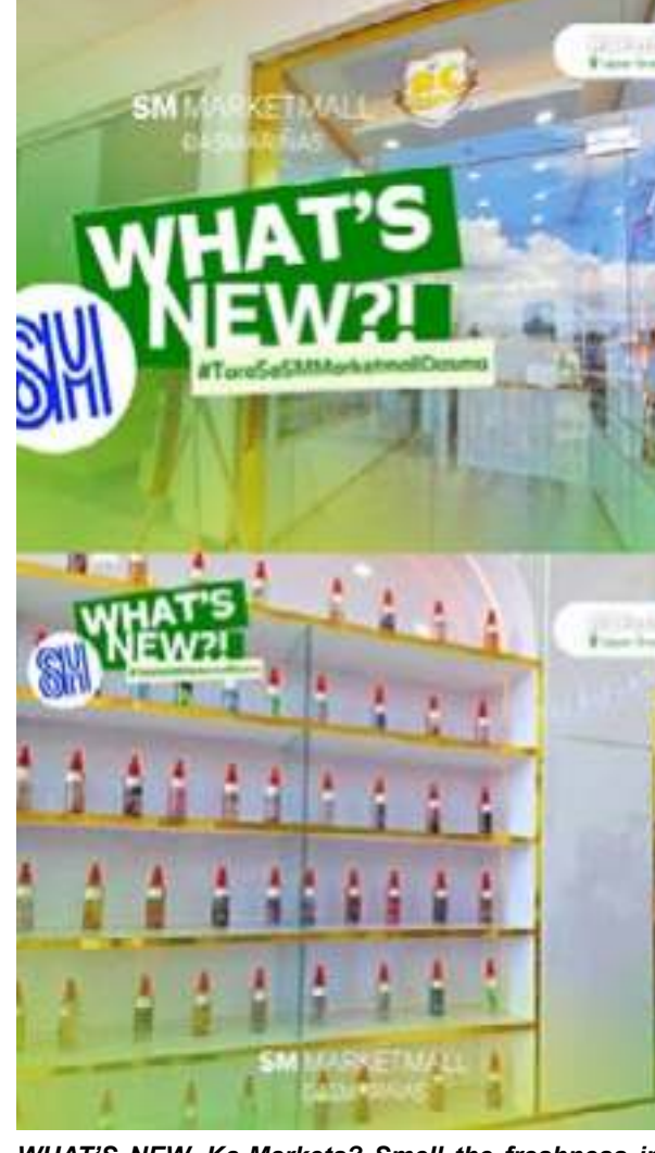
WHAT'S NEW, Ka-Markets? Smell the freshness in the air—RC Perfume is now open at SM Marketmall Dasmariñas! Visit them at the Upper Ground Floor, between DNSm Café and Juan Linaw, and discover your new favorite scent!

marunong nang magsalita ng Inata, at sa loob ng 10-15 taón, 2024-2039 nagagamit na ang Inata