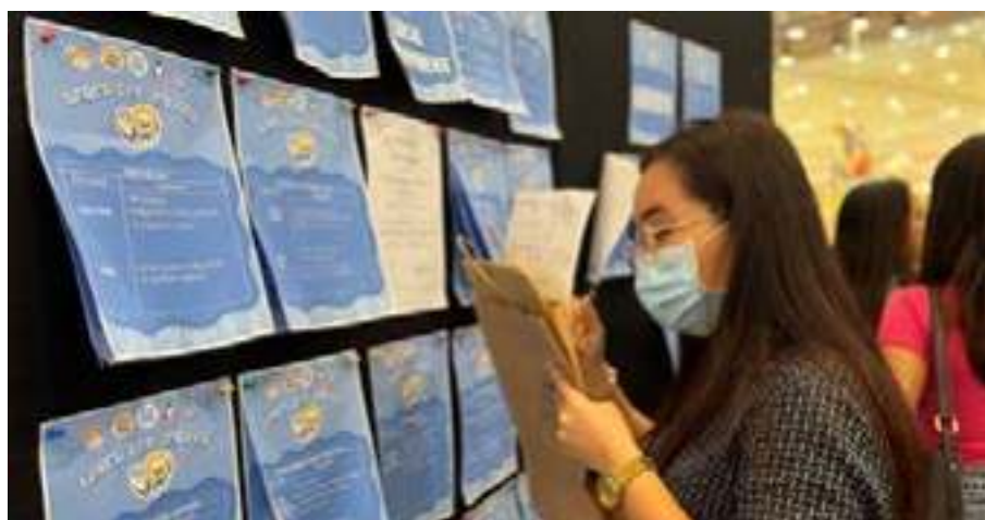
The SM Group Job Fair brings a wide range of career opportunities to jobseekers.