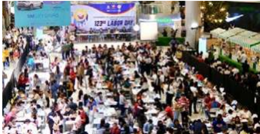
A bustling Labor Day job fair organized by SM fills SM City Davao, connecting numerous applicants with potential employers.

Looking for your next big move? SM Supermalls, together with SM Retail, invites jobseekers to the SM Group Job Fair happening this May 29, 2025 (Thursday) at the Main Event Center, SM City Dasmariñas.